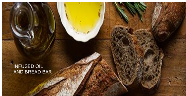
INFUSED OIL AND BREAD BAR

Enjoy a Variety of Deliciously Infused Oils or Enhance Your Creation With the Oil Seasonings Bar. Accompanied by an Assortment of Artisanal Breads $7.99 per dozen / minimum order 15 people