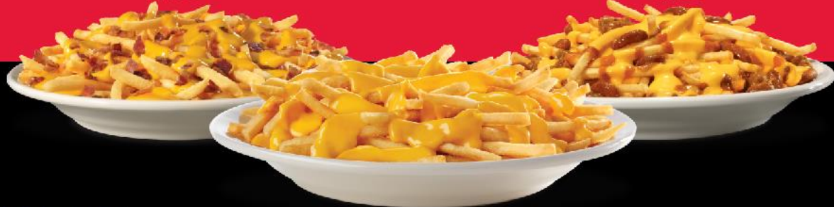
Chili Cheese Fries