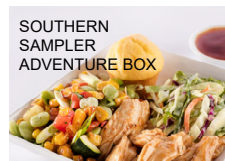
SOUTHERN SAMPLER ADVENTURE BOX