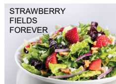
STRAWBERRY FIELDS FOREVER

$12.79 per guest / minimum order 3 people