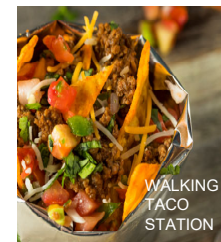
WALKING TACO STATION

$14.39 per guest/minimum order 20 people