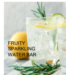
FRUITY SPARKLING WATER BAR