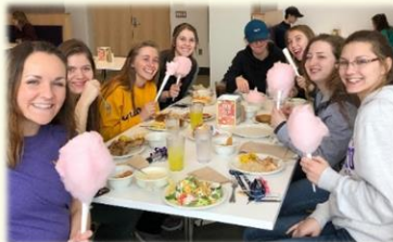
“The decorations are fun and it gives us something to look forward to!” McElroy E1 Floor